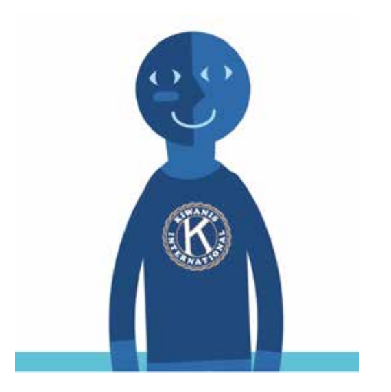
image worldwide. We must continue to promote the Kiwanis vision of being a positive influence in our communities. We can increase the name recognition worldwide and unify Kiwanis brands. We can promote our club's signature projects. Let's get ready for the next 100 years of service! Let's live Kiwanis! Let's share Kiwanis!

There are several ways to accomplish our goal of enhancing our Kiwanis