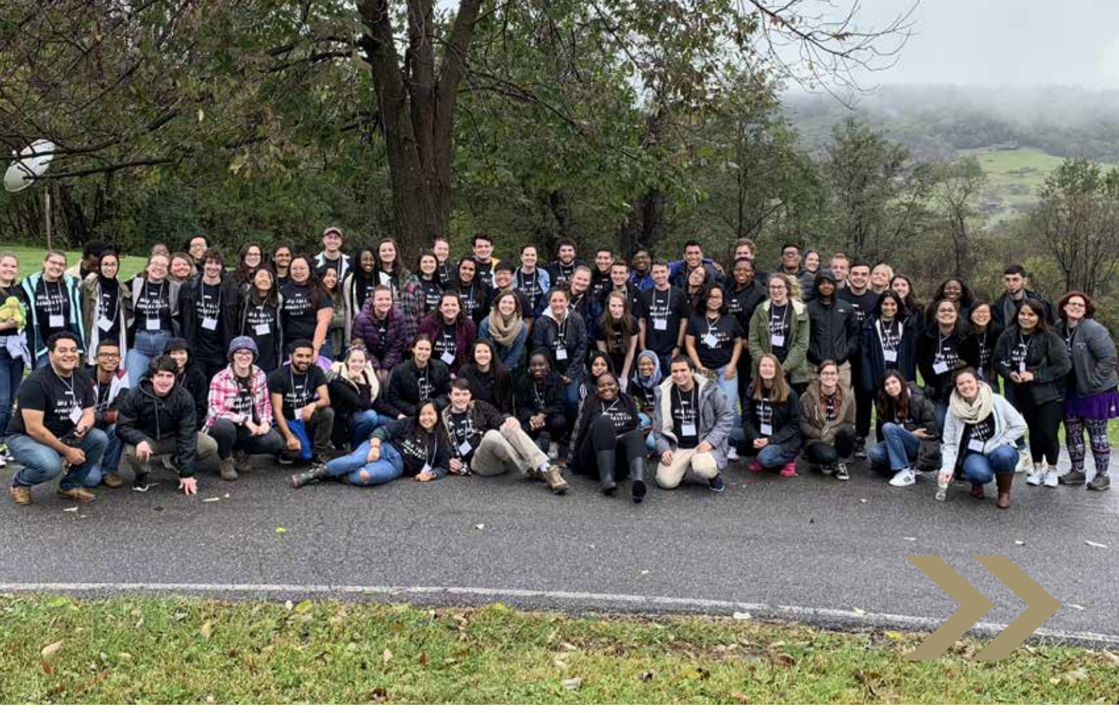
District CKI members attended their Fall Membership Rally in Front Royal, Virginia this past October.